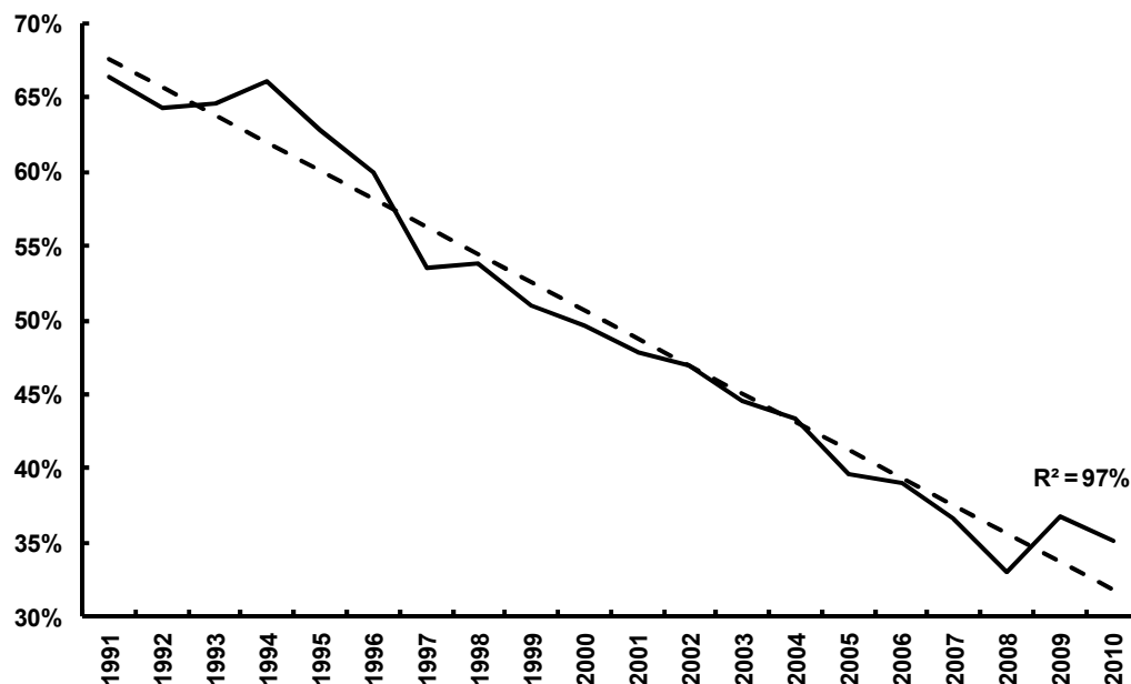
Figure 1. Historical development of the RWA/TA ratio of systemically important banks